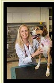
CTE Success Stories